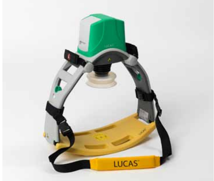
The LUCAS 2 chest compression system is shipped with one battery, patient straps, three suction cups, a carrying bag and the instructions for use. Also available are additional accessories and power options designed to meet your needs.