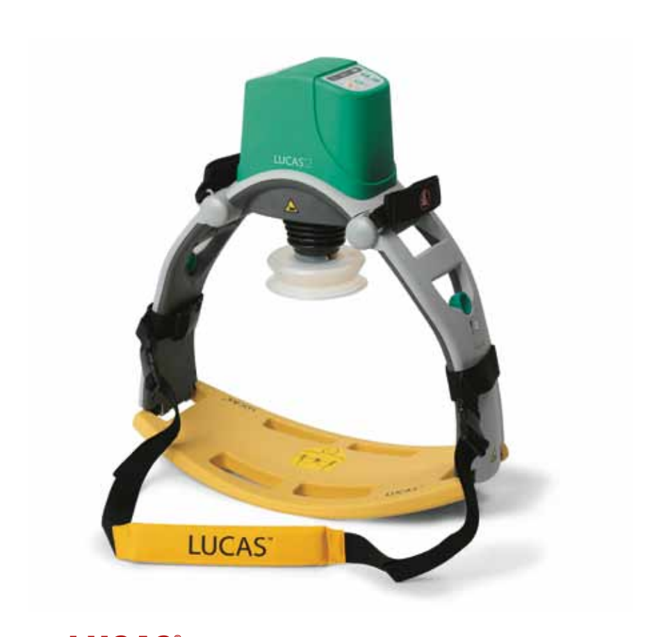
LUCAS ° CHEST COMPRESSION SYSTEM